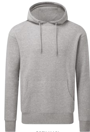
GREY MARL PAN COOL GREY 7C