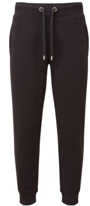
BLACK PAN BLACK