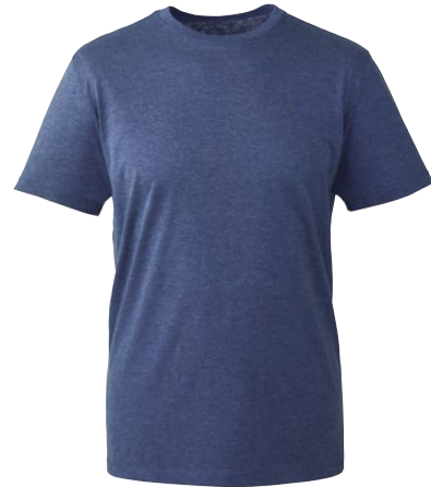
NAVY MARL PAN 4139C

Four must-have shades in Marl, an iconic twist on 60% organic cotton and 40% recycled polyester with a super-drape finish in 145gsm. Special attention has been paid to the chain stitch detailing on shoulders and nape and the twin-needle stitching to the hem and cuffs. Perfectly finished with a self-coloured size label.