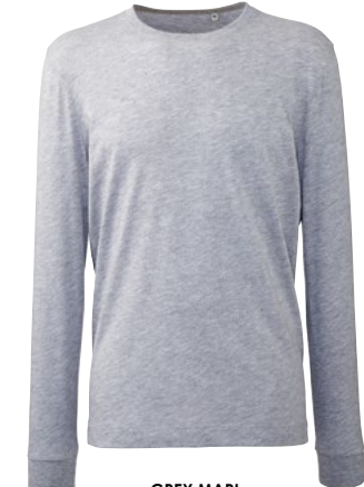
GREY MARL PAN COOL GREY 7C