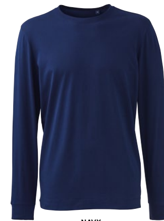
NAVY PAN 533C

A cool twist on our iconic t-shirt. Long cuffed sleeves counterbalance the ribbed crew neck with a retail fashion fit and soft-feel finish. Fashioned in solid shades of 100% organic cotton, or marls in 60% organic cotton with 40% recycled polyester. All longing to be adorned with your own decoration.