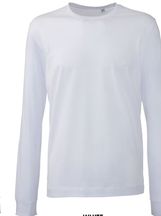
WHITE PAN WHITE