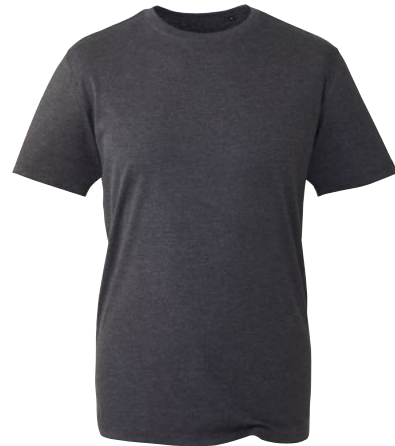
DARK GREY MARL PAN 425C