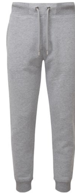
GREY MARL PAN COOL GREY 7C

Kick back and chill in these ultra-soft and fleecy joggers in a choice of classic colours. The ribbed waistband with jumbo, colour-matched draw cord offers a relaxed fit, while the brushed inner fleece makes them so cosy to wear.