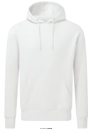
WHITE PAN WHITE

Lighten up with the Anthem Unisex Hoodie. Re-designed for 2023, it features a lightweight hood and skinny drawcords with matching eyelets and ends. Plain perfection, or ready for decoration. Because details matter.