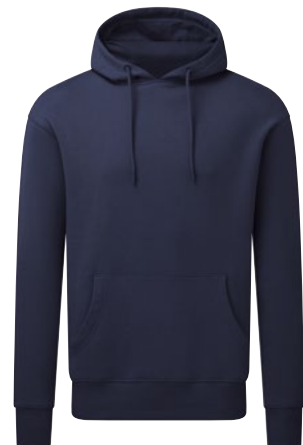
NAVY PAN 533C