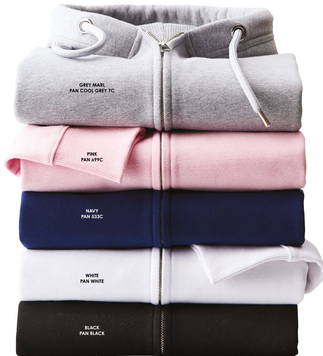
AM004 Women's Anthem Full Zip Hoodie

What's on your wish list? Eco fashion? Luxurious fabrics? Perfect for print? The Women's Anthem Full Zip Hoodie ticks all the right boxes in soft-feel organic cotton with recycled polyester. A masterpiece in muted pastels or strong neutrals with high-quality finishes and superb detailing.