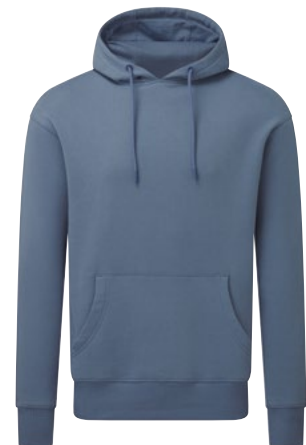
INDIGO BLUE PAN 2166C