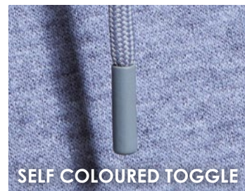
SELF COLOURED TOGGLE