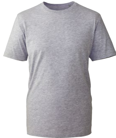
GREY MARL PAN COOL GREY 7C