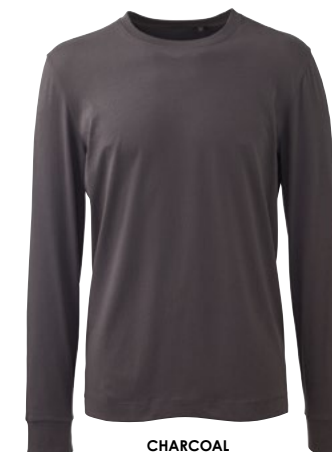
CHARCOAL PAN 425C