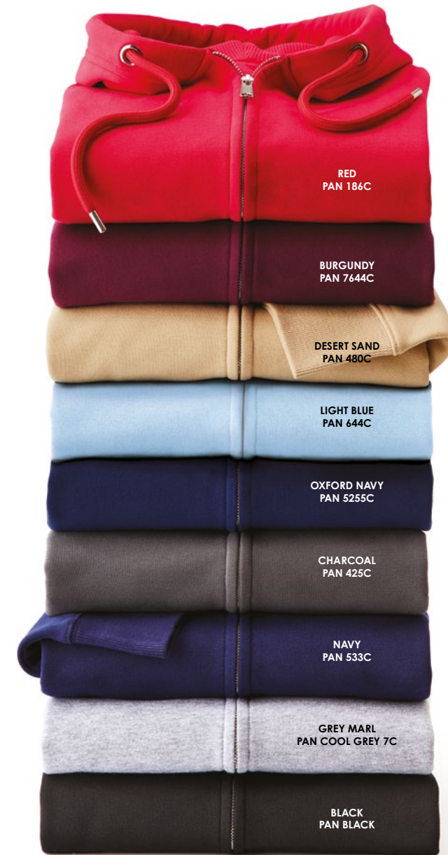
AM002 Men's Anthem Full Zip Hoodie

The best things come in threes: ethically sourced, in exceptional fabrics and ready to embellish. Like the Men's Anthem Full Zip Hoodie in soft-feel organic cotton with recycled polyester. Available in a cool collection of colours with exceptional details, high-quality finishes and a concealed zip.