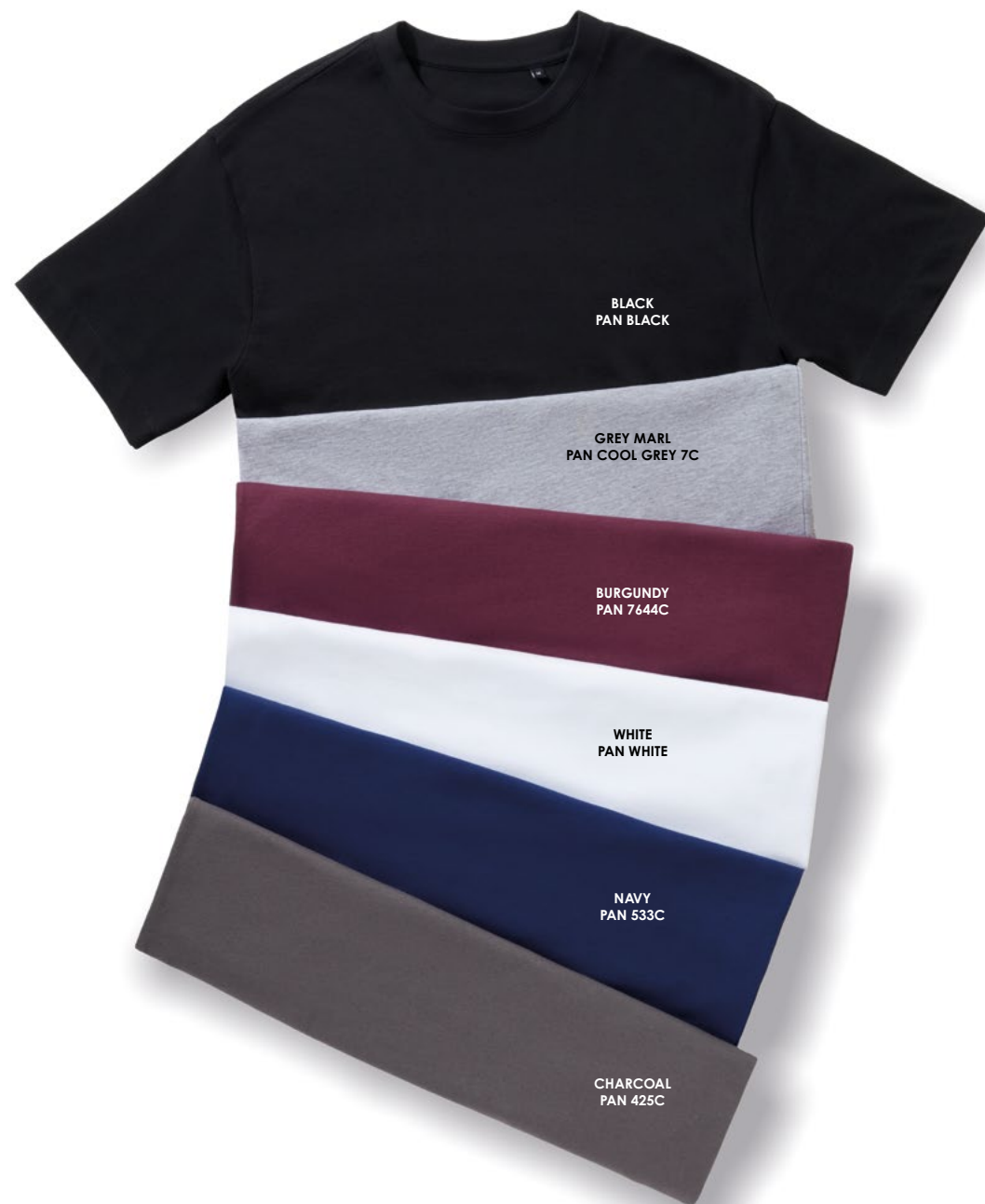
AM015 Anthem Heavyweight T-shirt

We've upped our game with this iconic heavyweight t-shirt. At 220gsm, it's a substantial weight with a retail-ready oversized cut. Available in our most popular colourways, it's designed with music and fashion lovers in mind.