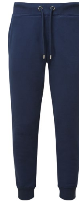
NAVY PAN 533C