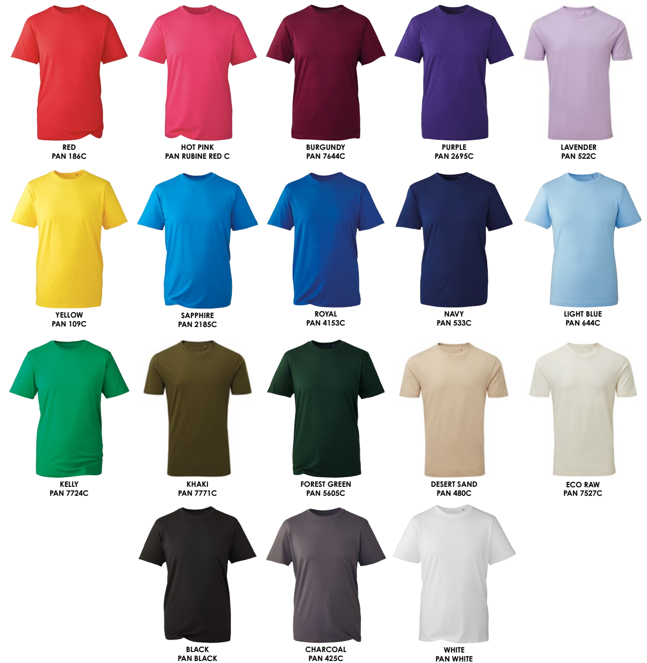
AM010 Anthem T-shirt

An iconic t-shirt with a ribbed crew neck, retail fashion fit and a soft-feel finish. Choose from a cast of incredible colours in 100% organic cotton. All with chain stitch detailing on the shoulder and nape, twin-needling stitching on hems and cuffs, and a self-coloured size pip. Essential wearing.