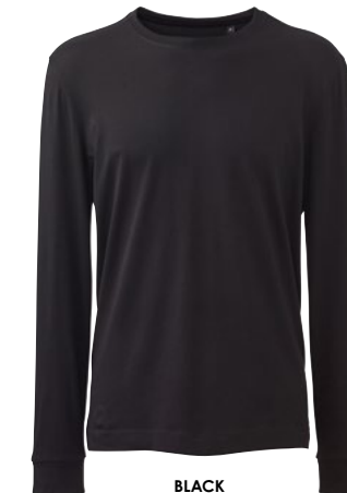
BLACK PAN BLACK