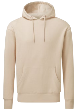
DESERT SAND PAN 480C