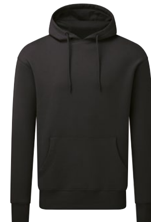
BLACK PAN BLACK